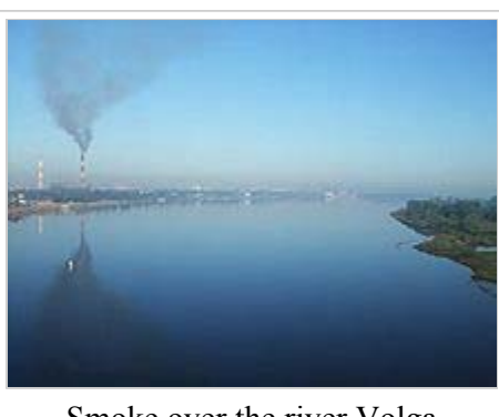
Smoke over the river Volga