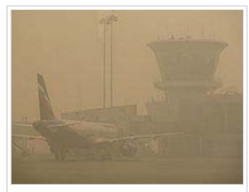
Reduced visibility due to wildfire smoke in Sheremetyevo airport (Moscow, Russia) 7 August 2010.

Smoke contains a wide variety of chemicals, many of them of aggressive nature. Examples are hydrochloric acid and hydrobromic acid, produced from halogen-containing plastics and fire retardants, hydrofluoric acid released by pyrolysis of fluorocarbon fire suppression agents, sulfuric acid from burning