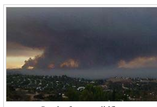
Smoke from a wildfire

Smoke from a typical house fire contains hundreds of different chemicals and fumes. As a result, the damage caused by the smoke can often exceed that caused by the actual heat of the fire. In addition to the physical damage caused by the smoke of a fire – which manifests itself in the form of stains – is the often even harder to eliminate