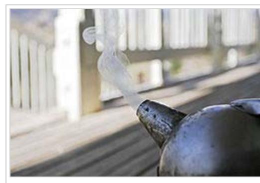
Smoke from a bee smoker, used in beekeeping

Smoke particles are an aerosol (or mist) of solid particles and liquid droplets that are close to the ideal range of sizes for Mie scattering of visible light. This effect has been likened to three-dimensional textured privacy glass [citation needed] — a smoke cloud does not obstruct an image, but thoroughly scrambles it.